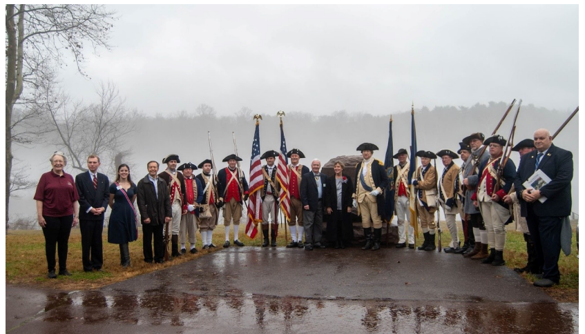
Washington Crossing National Color Guard Event