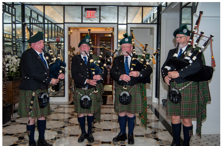
Pipers at the Installation Banquet