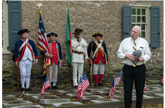
Color Guard at Axes' Burial Ground

Massey House is a long-time event on the PCC Color Guard October schedule, and we had a good showing, with five guardsmen. The following day, October 22 nd , I represented Penn-