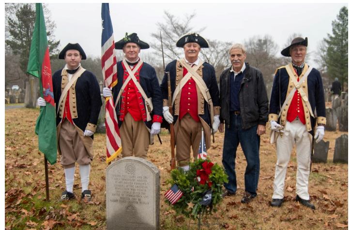
Color Guard at Boehme's Historic Church