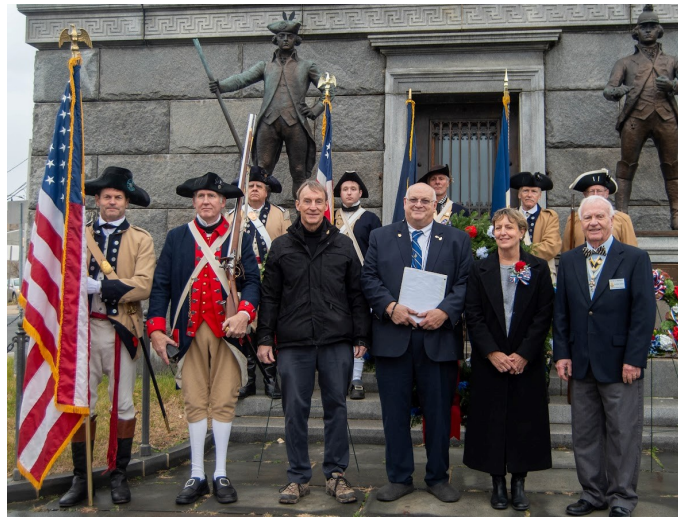
Color Guard at Trenton War Memorial

In December, I received a request from Villanova