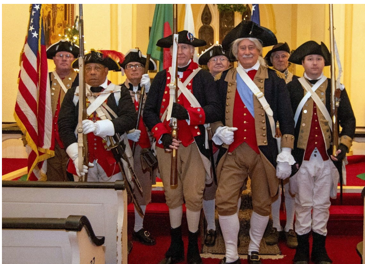
Color Guard at the Bridgeport St. Lucia event