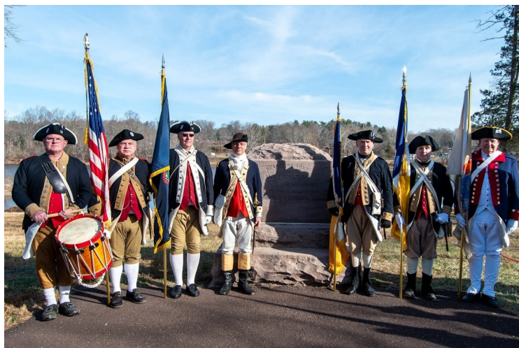
Color Guard at Washington Crossing National Color Guard event