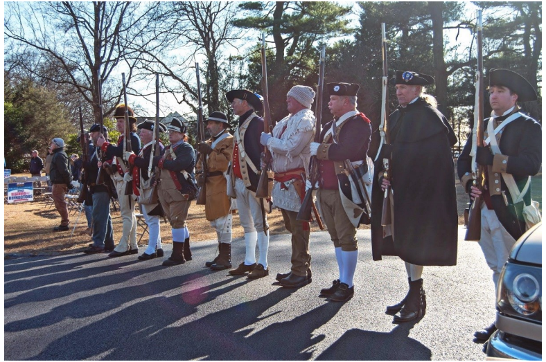
Color Guard at the Paoli Battlefield