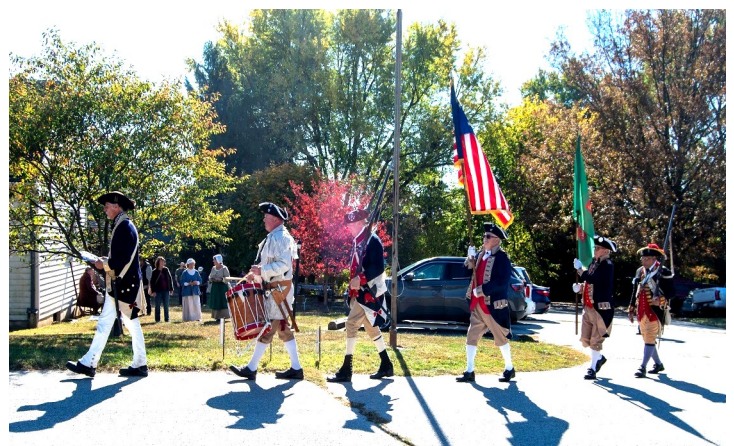
Color Guard at the Massey House